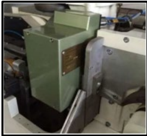
Microwave Weight Control Scanning Head