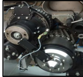
New Type Turning Drum