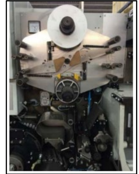
New Type Bobbin Changer and Splicer