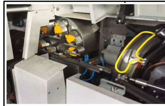
Protos type Cut-Off and Spider