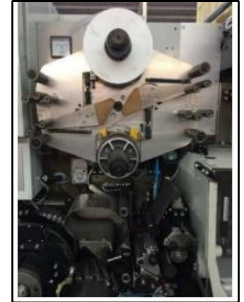
New Type Bobbin Changer and Splicer