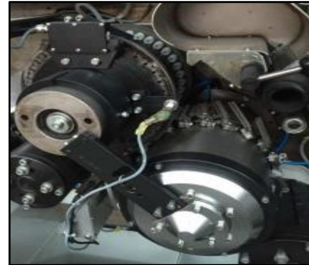
New Type Turning Drum