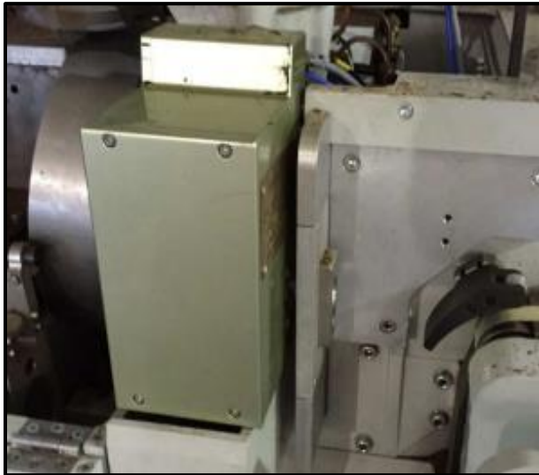
Microwave Weight Control Scanning Head