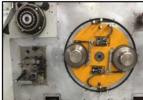
Bobbin Changer and Printer