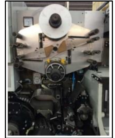
New Type Bobbin Changer and Splicer