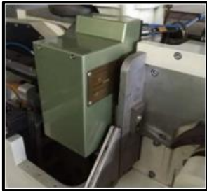
Microwave Weight Control Scanning Head