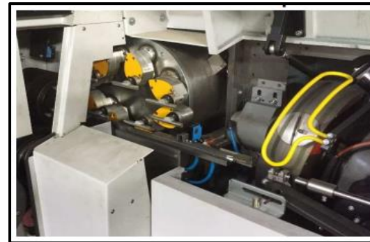
Cut-Off and Spider