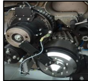
New Type Turning Drum